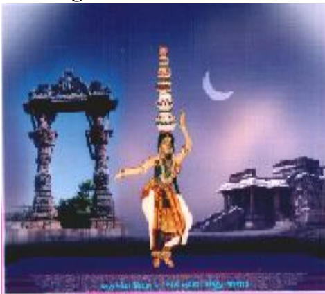
Fig. 4. A Picture of Acting